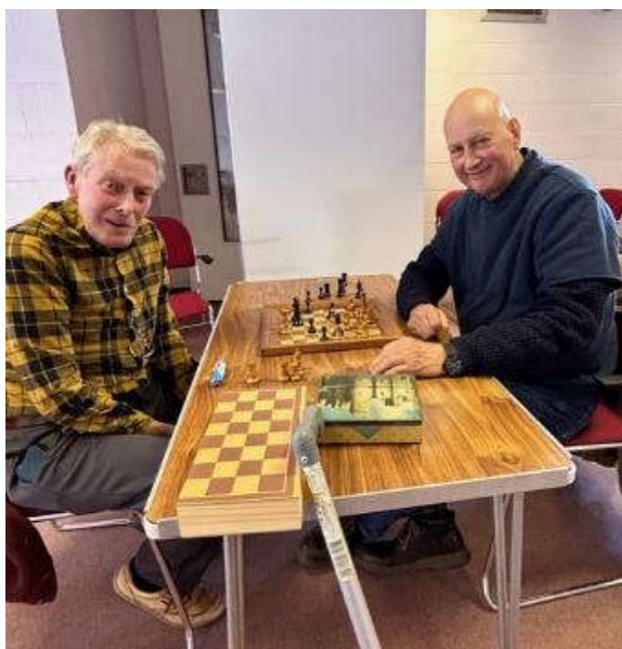
A game of Chess in progress

For more details contact Sally: 01483 428646