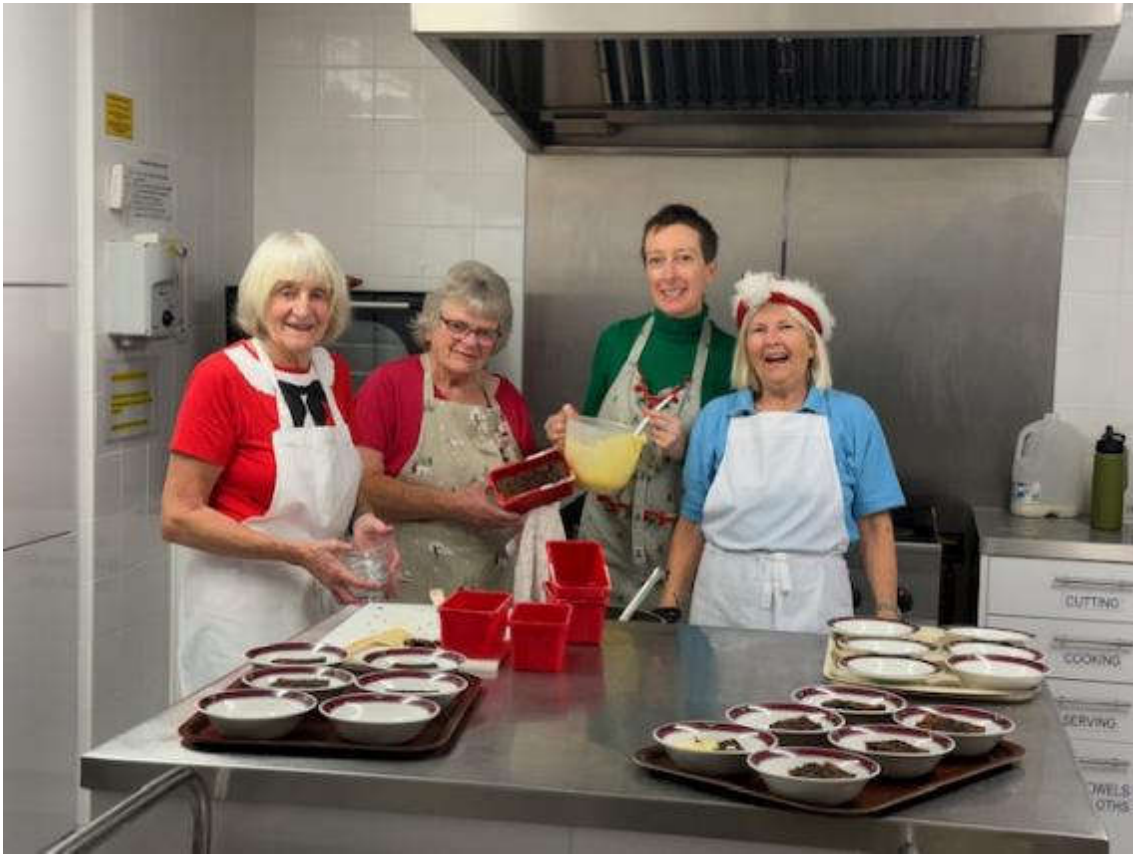
Christmas Puds are ready!