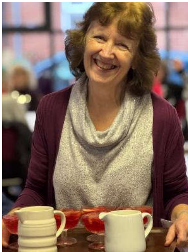
Happy Christmas Everyone!