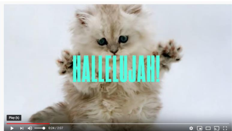
Praise Ye The Lord Hallelujah (NEW VERSION)

The Point: To praise God and understand that we can worship him whatever the weather and however we're feeling.